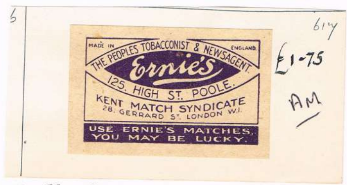
Matchbox Labels Unlimited, Habetown, Cornwall Specimens Guaranteed Genuine

BRAND COUNTRY MANUFACTURER/IMPORTER TRADE MARK No. CONDITION DATE (approx.) ORIGIN COMMENT PRICE