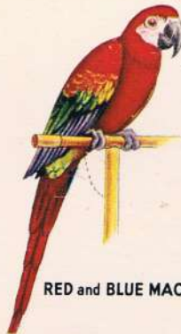
RED and BLUE MACAW